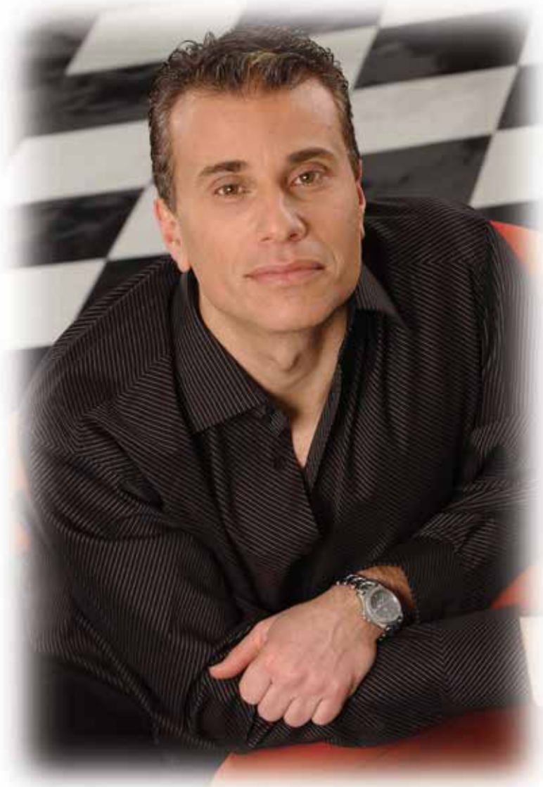
Michael Landsberg, Host of TSN's Off the Record